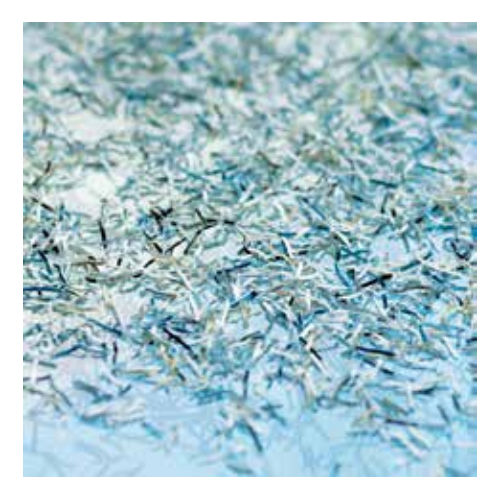
P-6 security: recommended for data media containing secret data demanding exceptionally stringent security measures