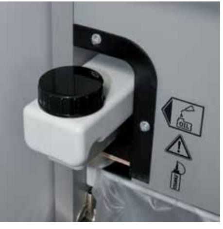
Integrated oil tank for controlled, automatic lubrication of the cross-cut cutters helps to lengthen service life while keeping performance constant