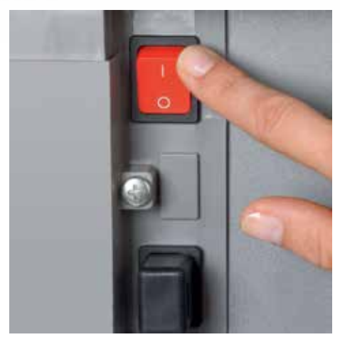
Separate main switch is located on the rear of the document shredder and completely disconnects it from the mains power supply