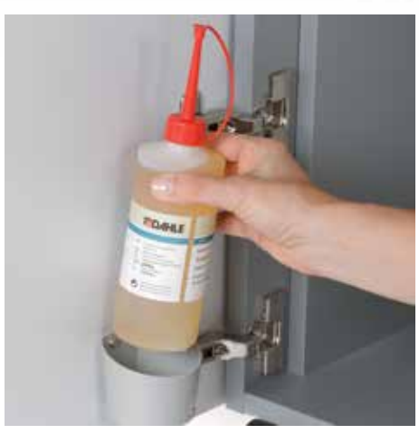
Environmentally friendly oil is always easy to access, included with all cross-cut models