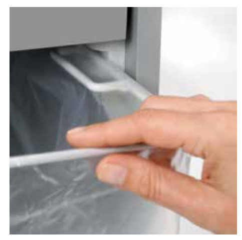
Pull-out rounded top frame that's kind on the fingers when changing the waste bag