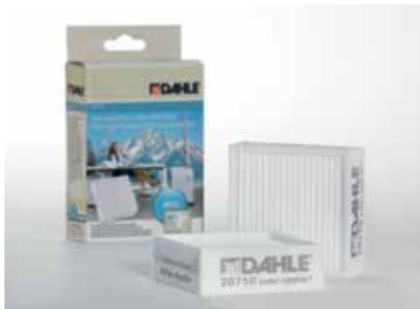
Fine particle filters Dahle 20710