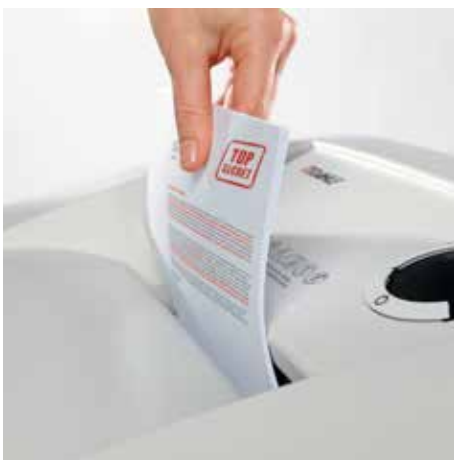
Innovative MHP technology® shreds up to 30 % more paper