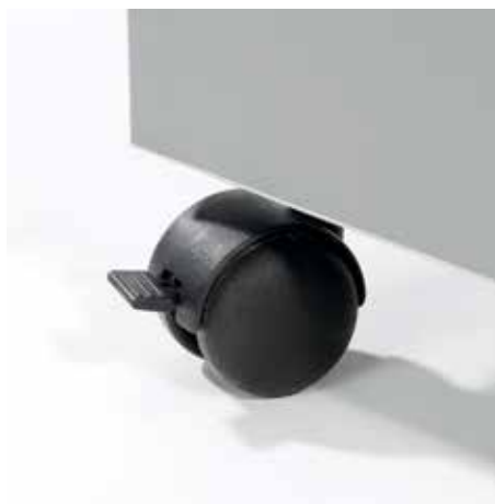
Practical swivel casters for flexible use