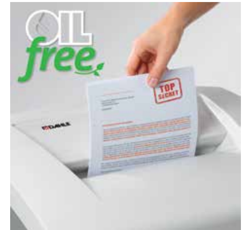
Shredding the convenient way, all without the time-consuming process of oiling the cutters