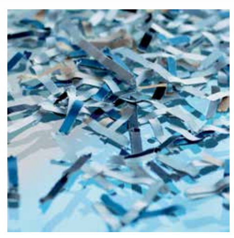
P-4 security: recommended, for example, for data media containing particularly sensitive, confidential and personal data