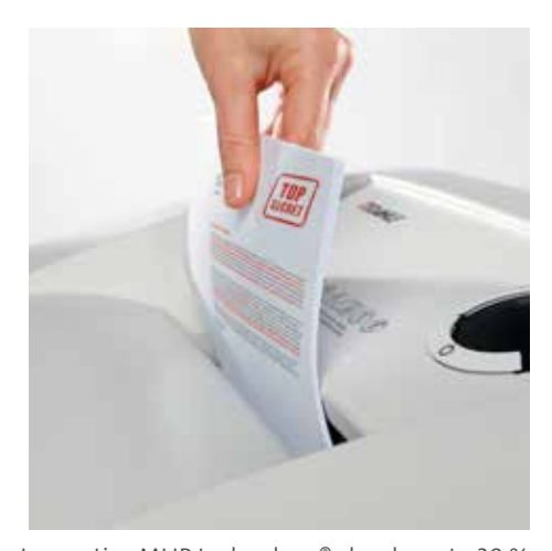
Innovative MHP technology® shreds up to 30 % Practical swivel casters for flexible use more paper