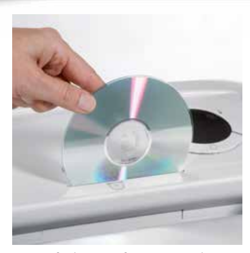
Separate feed opening for CDs, DVDs, cheque and credit cards guarantees reliable shredding of optical, magnetic and/or electronic data carriers