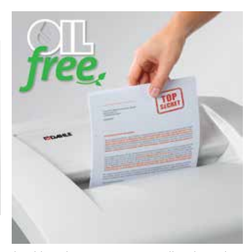
Shredding the convenient way, all without the time-consuming process of oiling the cutters